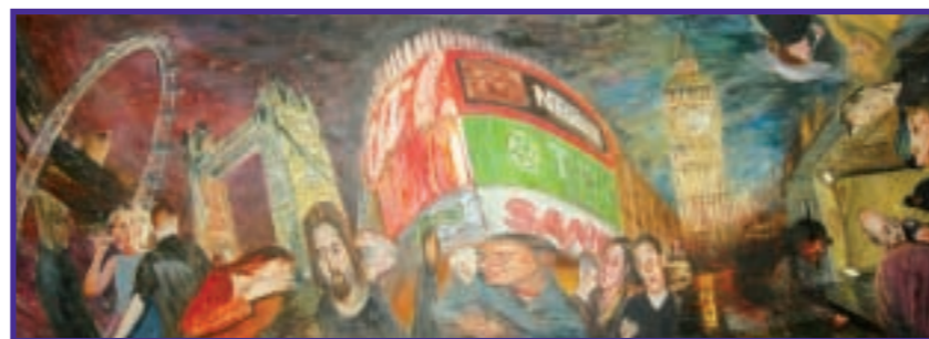
Painting displayed at 196 Bishopsgate